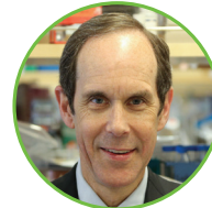
Brian J. Druker, MD Lila and Murray Gruber Memorial Cancer Research Award and Lectureship